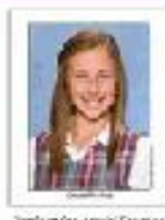
Order for 10x15 Frames